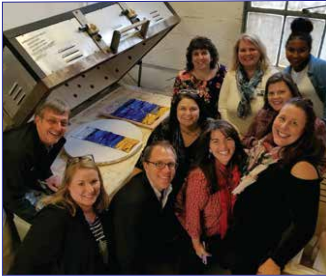
VA Productions – Fused Glass – Mounted Wall Mural