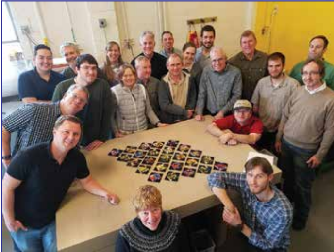
Precision Medical – Fused Glass – Musical Mosaics