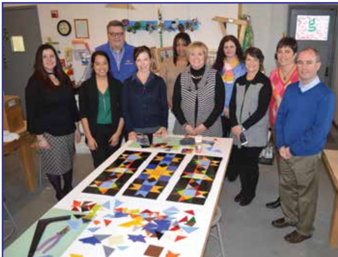
Berks County Community Foundation – Fused Glass – Mounted Wall Mural